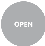
OPEN (XXX) XXX-XXXX First.last@equitable.com AL, MS, TN, AR, MO