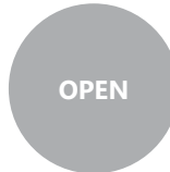
OPEN (XXX) XXX-XXXX First.last@equitable.com Greater NY