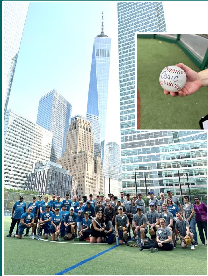
ABOVE: Both teams gather for a photo in the shadow of the Freedom Tower, in the Battery Park Ball Fields.